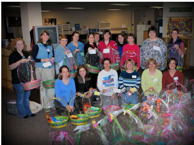
Basket Assembly at March Membership Mixer

Please pass on my thanks and gratitude to all your members